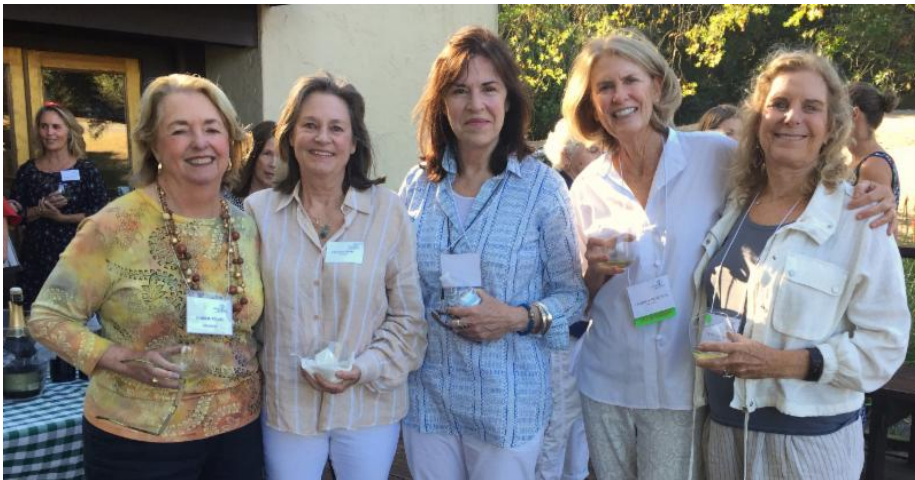
Impact100 members and guests enjoy a casual evening to learn about our shared work

On a balmy early summer evening, 25+ members and guests enjoyed appetizers and wine on the deck of the George Ranch Clubhouse overlooking a pond fringed with breezy grasses. Though the setting was reason enough to gather, the purpose of the evening was to provide interested women an opportunity to learn about Impact100 Sonoma.