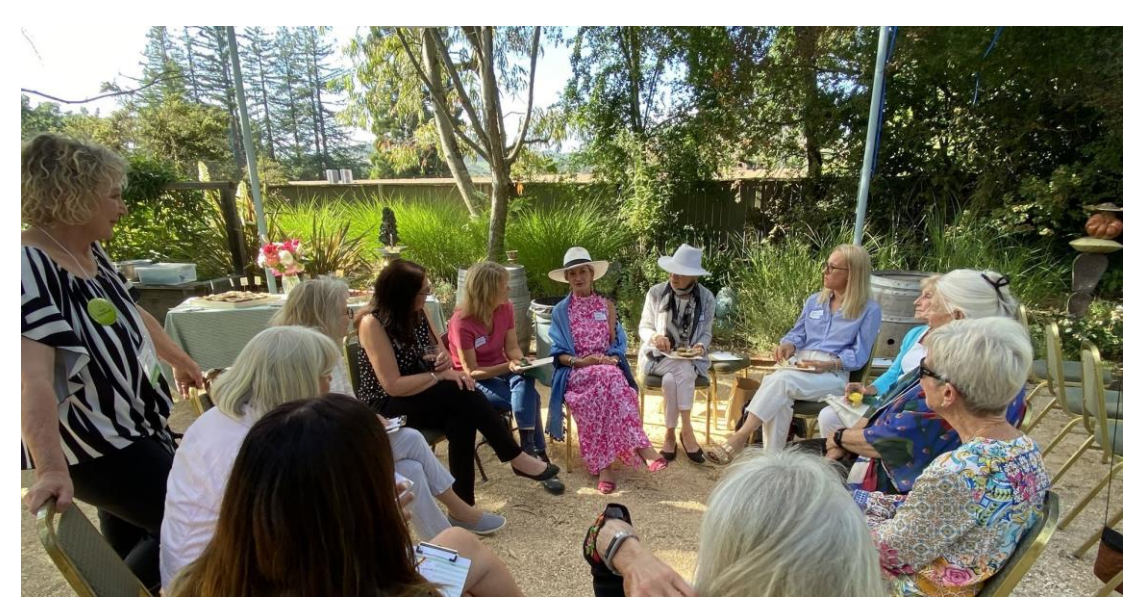
Breakout sessions provided opportunities to share personal stories and find common ground.