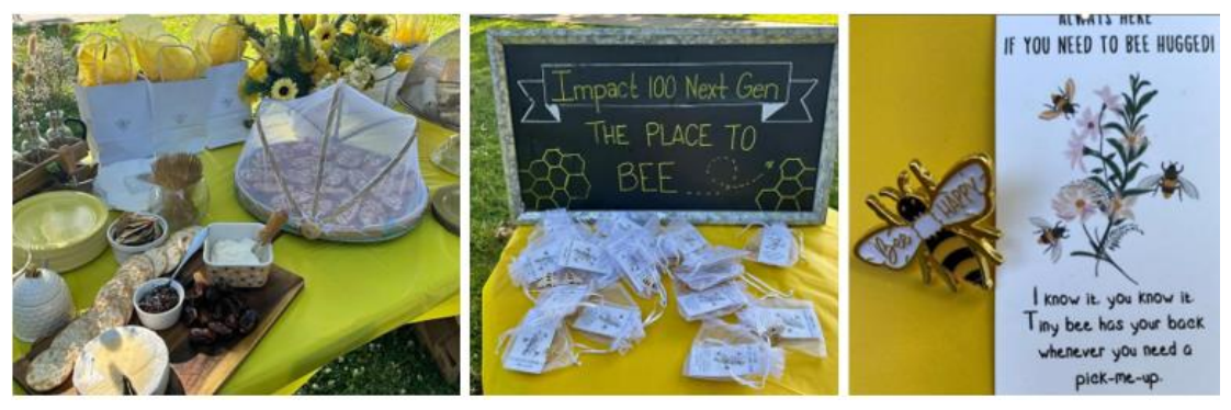
Delicious food, creative presentation, and good company made our meetup the place to "bee."